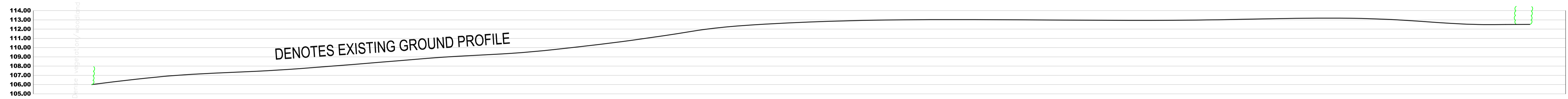
TORIAD A-A, MESURIAD survey section A-A 1.250